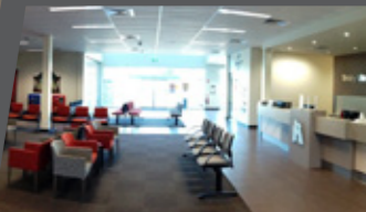
Trinity Medical Clinic built for private investors and fitted out with the latest technologies for Medical Specialist and expert care: AU$5 million.