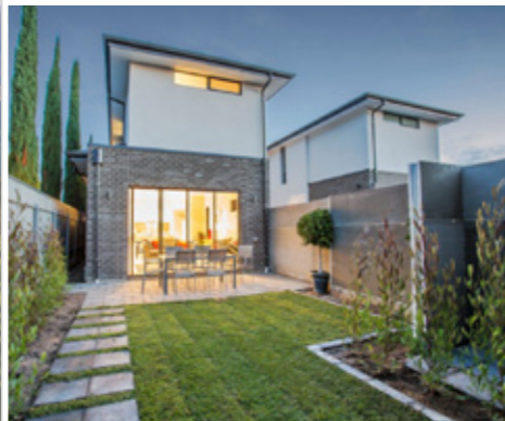
Luxury townhouse development in Parkside, walking distance to the CBD, developed within a AU$3.2 million budget featuring finest quality fittings throughout.construction.