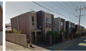
Brompton – city fringe living: 17 rendered townhouses constructed within a project budget of AU$7 million.