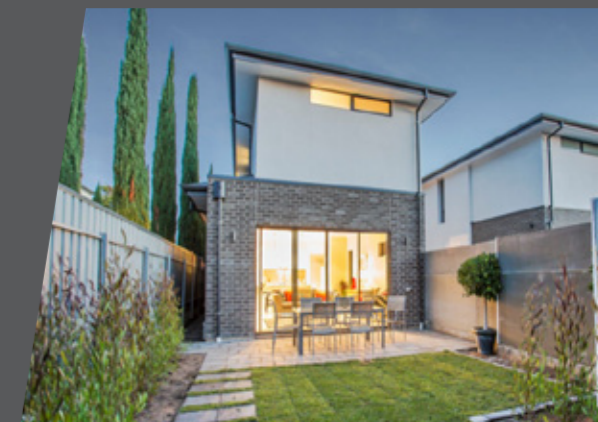
Luxury townhouse development in Parkside, walking distance to the CBD, developed within a AU$3.2 million budget featuring finest quality fittings throughout construction.