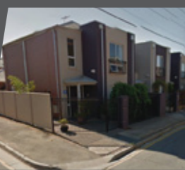
Brompton – city fringe living: 17 rendered townhouses constructed within a project budget of AU$7 million.