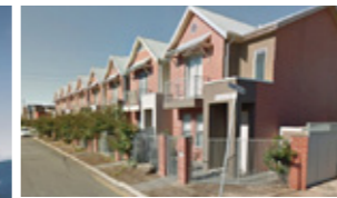
Contemporary red brick townhouses developed within AU$3.6 million budget.